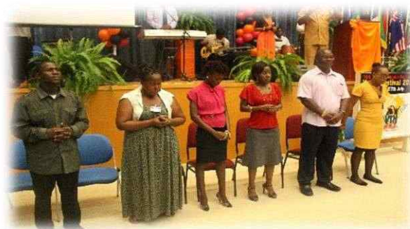
NEWLY-ELECTED YOUTH EXECUTIVES